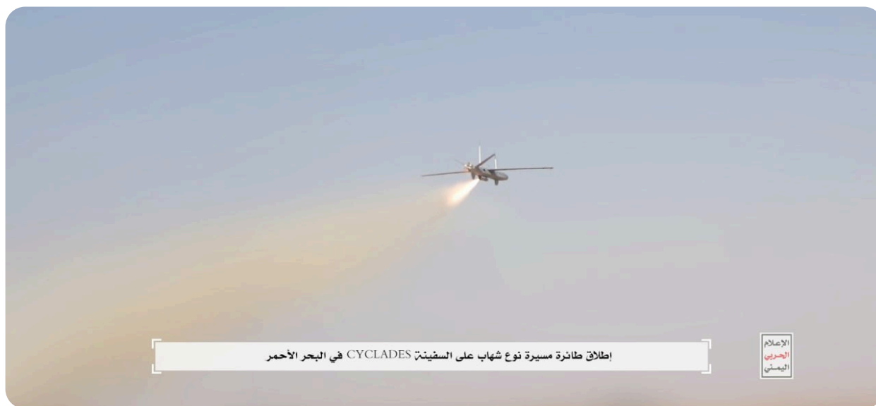
Illustrative image of Samad-2/3

Based on the sensitivity of the targets, it is assessed that the Houthis likely employed Tankeel ASBMs, Samad-2/3 UAVs, and Al Mandab-2 (Houthi version of Iranian Qader) ASCM in the attack.