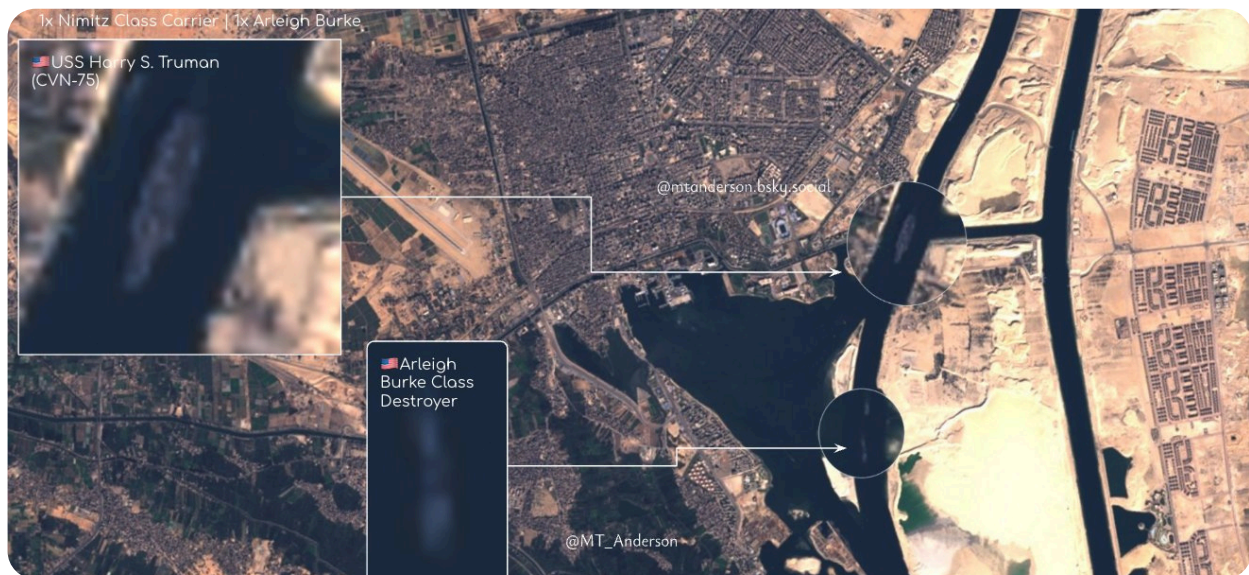
USS Harry S. Truman and its strike group transiting the Suez Canal SB on 15 Dec 2024

Fleet Forces Commander Adm. Daryl Caudle has emphasized the need to stop the flow of weapons to the Houthis to prevent their attacks on merchant shipping. This approach is part of a broader international naval strategy, where ships from various nations ( Caudle noted that the French and United Kingdom navies are expected to begin operations in the region soon. ), including those from Carrier Strike Group 8, are enhancing their presence in the region. This collective effort not only aims at deterring Houthi aggression but also supports maritime security through multinational cooperation.