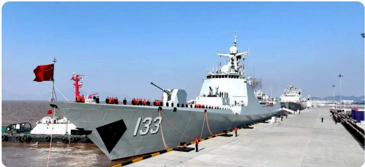
Footage of PLA 47 th Fleet