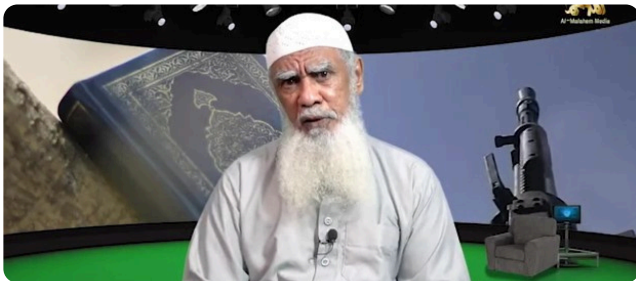
IMAGE FEATURING Khabib Al-Sudani FROM THE RECENT CLIP RELEASED BY AQAP.

In addition, the recent triumph of Syrian rebels and the extensive release of captives from Sednaya jail have enhanced morale inside jihadist factions. Communications on extremist forums have characterized these events as operational achievements, with explicit demands to imitate similar activities, including possible offensives aimed at critical locations like Aden and its prison.