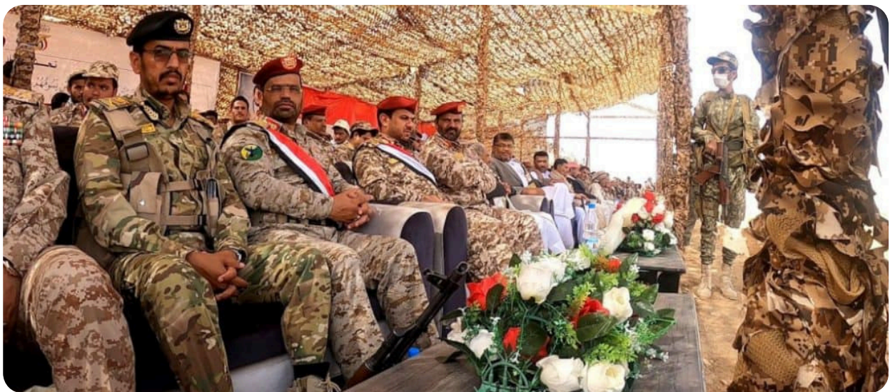
ILLUSTRATIVE IMAGE OF HOUTHI MILITARY AND POLITICAL COMMAND

They have implemented ground-level strategies to solidify power, instructing their operatives to monitor and report on tribal leaders and significant societal figures.