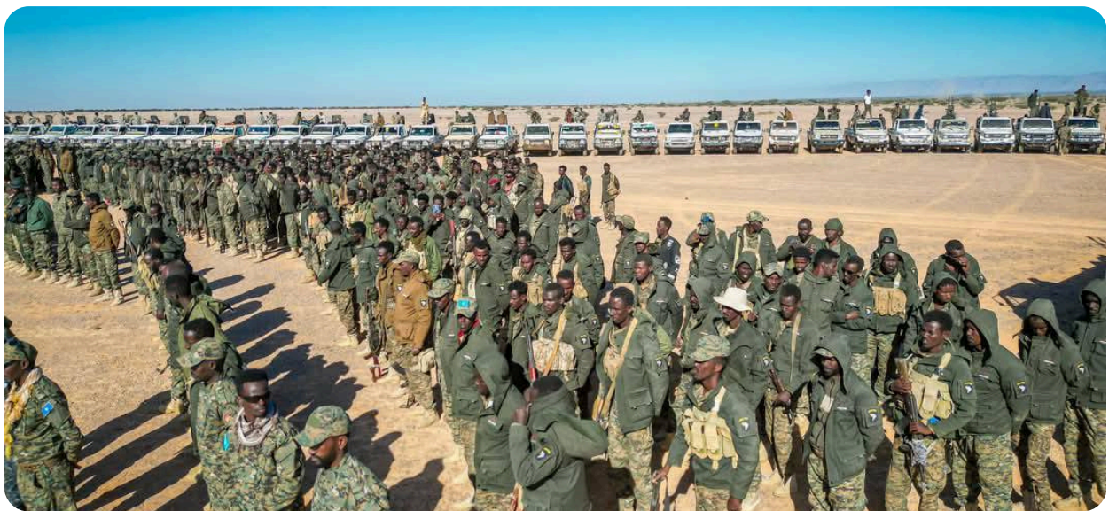
Image of Puntland Forces

Concurrently, supporters of IS Somalia have escalated their activities by issuing threats against Puntland's soldiers and intensifying psychological operations (PSYOP) to undermine morale and operational effectiveness.